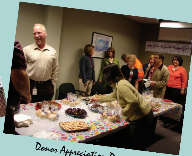
Donor Appreciation Day

As we continue to deal with a depressed economy, the FJC Executive Board moved forward with plans to start a private fund raising mechanism to support some of the programs and services of the Center. The Family Justice Center Foundation Fund was established with the Greater Tacoma Community Foundation in 2009. A Fund Development Committee comprised of more dedicated volunteers will be working together to raise awareness about the FJC and how those in our community can help ensure that clients have the services and support they need.