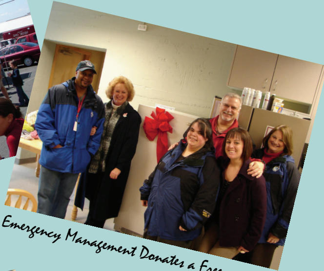
Emergency Management Donates a Freezer