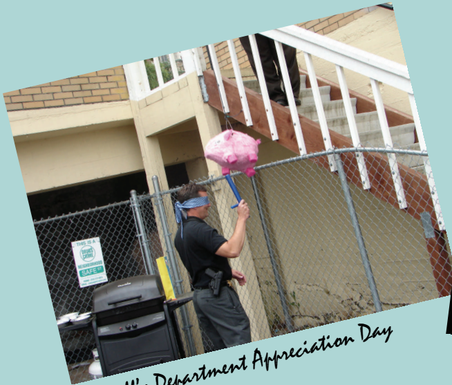
Sheriff's Department Appreciation Day