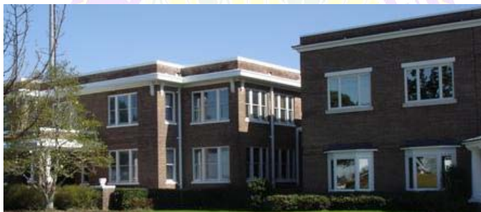
Two buildings – FJC in one, CAC in the other – rented office space