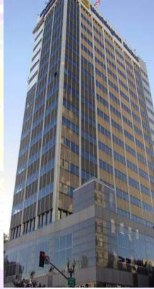
Mixed use building – city rents space